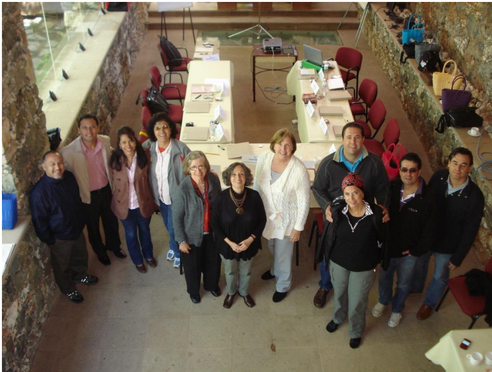
Comunalia's 2012 annual meeting

The evaluation challenge for community foundations needs to be based on helping organisations to appreciate the importance of outcome evaluation (of the “right kind” of course - one that values participation and social capital as well as hard numbers and financial and material gains).